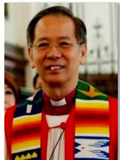
Archbishop Moon Hing

He leads up the communion-wide task team for [motivating and resourcing] discipleship.