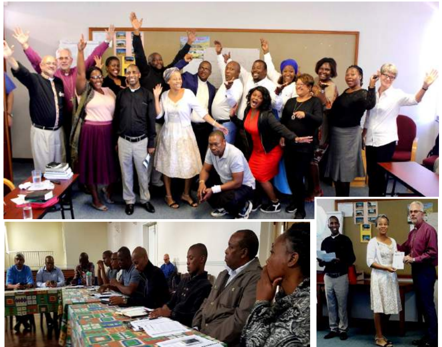
Above: These trainees were trained to make disciples who make disciples.